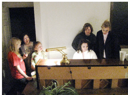
Working late in AL, no one minded!