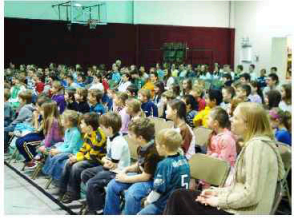
Students grades 1-8 enjoying the presentation.

It's a blessing to share Jesus and it's a special blessing to be asked by so many Christian schools to come and share with the students! I so love this part of the ministry! Imagine speaking to a group of young people ages 6 thru 15 and trying to keep everyone's attention! God allows me to do that and more! These students are not only attentive, they are involved!