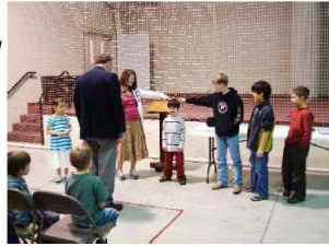
Who is the King of the universe? J-E-S-U-S!

Donations may be made out to Changed Lives Ministries P.O. Box 245 Spencer, Ohio