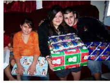
"Yep! I got my piano! Thank you Jesus!"