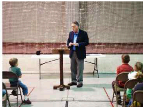
They'll listen if you have something to say!

It's a blessing to share Jesus and it's a special blessing to be asked by so many Christian schools to come and share with the students! I so love this part of the ministry! Imagine speaking to a group of young people ages 6 thru 15 and trying to keep everyone's attention! God allows me to do that and more! These students are not only attentive, they are involved!