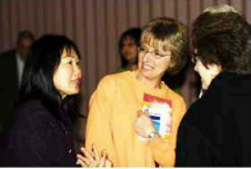
Meet Nice People!