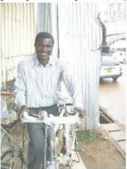
Kenyan Pastor and his new bike!

These "Get Out of Hell Free" Monopoly cards are ministry tracts in great demand all over! We've passed out thousands!