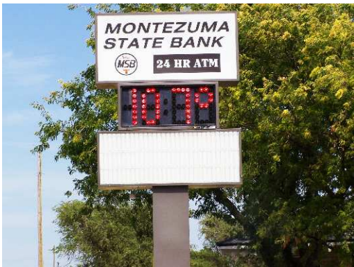
It was hot in Kansas!

"Our obligation to the Gospel is to preach it." Oswald Chambers