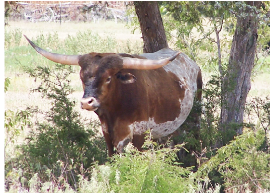
This guy found himself a little shade.